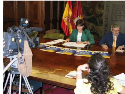
Europ Mobility Week initiative León - Spain

Several political actors involved: Ministry of Environment, Government of Castilla and León, Municipality of León (3 departments)